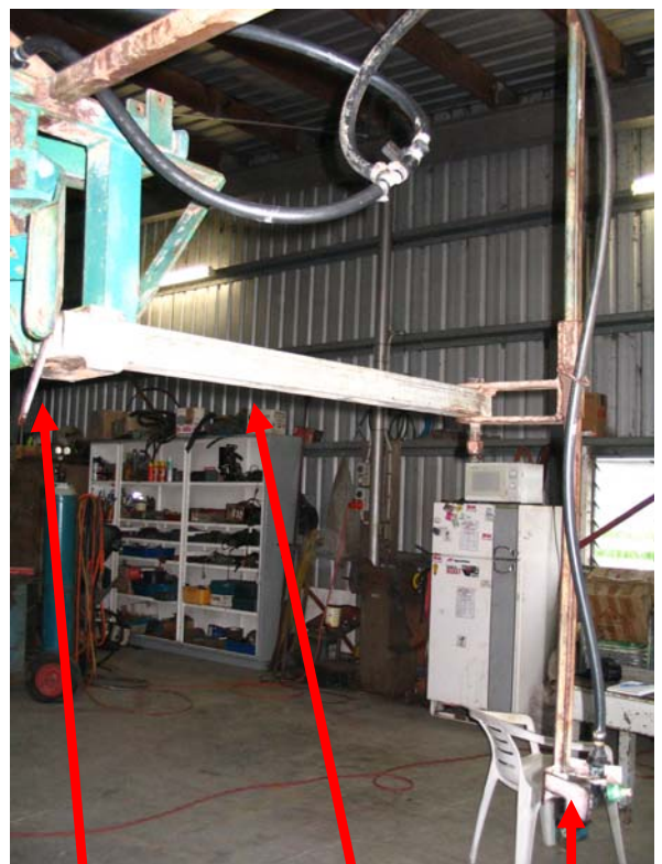
Original dropper position.